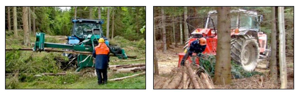
Figure 1. Tractorprocessor NIAB 5-15

In case of the surfaces on which the processor was working, the role of the chain saw operator was reduced to cutting and felling trees. Debarking and cross-cutting was performed by a processor located on the skidding routes (Fig. 1). The obtained basic material in the form of the middle-sized timber logs, was situated in irregular piles, directly by the routes from which it was then skid by means of self-loading trailers. Therefore, the described technology could be qualified within the framework of Cut-To-Length method (CTL<sub>TractorProcessor</sub>) with two-stage skidding.