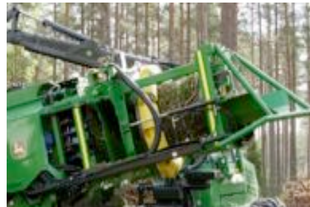
Figure 2. John Deere B380 Bundler unit