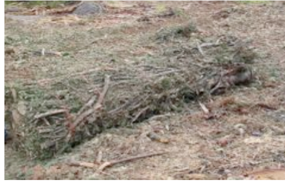
Figure 4. Slash bundle

Outputs of the two operations differ as well. Wood chip piles in storage pose a moisture content issue. Although the top and outer portions of chip piles can be dried to much lower moisture contents, the insides of chip piles remain much more saturated. With many of the biomass consuming plants desiring low moisture contents, any low energy process to dry biomass could prove to be a huge asset to the industry. Bundles have much more air space and air dry much better than chip piles. Within one month, bundles lost between 10 and 25% moisture content (Patterson 2008). The loss of moisture content through evaporation in the bundles cause a 12-28% increase in energy content per unit volume (Karha 2006).