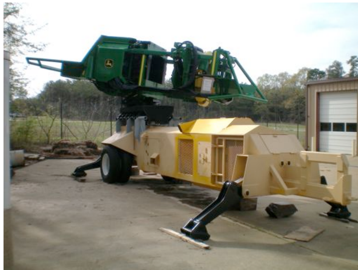
Figure 5: Trailer mounted B380

The completed unit is shown in Figure 5. While the initial plans called for a remote control, proprietary software made such a connection too difficult. A tethered line was used to operate the bundler, though in the finished product the loader operator will control the bundler via a remote control.