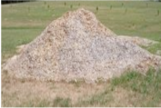
Figure 3. Pile of wood chips