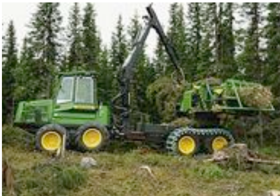
Figure 1. John Deere 1490D Slash Bundler

The John Deere biomass bundler is commonly used in applications with cut-to-length harvesting systems that require it to travel within a stand. John Deere currently manufactures the 1490D which consists of a B380 biomass bundling unit mounted on a forwarder chassis (Figures 1 and 2). In order to reduce costs, maximize efficiency, and implement the bundler in a tree length harvesting operation, this project will test a prototype harvesting system. The objectives of this venture are to: a) adapt the John Deere B380 bundler unit to a motorized trailer; b) design the optimum deck configuration; c) conduct a productivity study of the bundler unit.